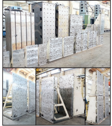
VIEW OF ANGLE PLATES

ALSO: WELDERS, TOOL CRIB, MAGNETIC MACHINE CHUCKS, T-SLOTTED RISER BLOCKS, T-SLOTTED ANGLE PLATES, PARALLELS, CLAMPING TOOLS, SCREW JACKS, TOOL HOLDERS, PERISHABLE TOOLING, HAND AND POWER TOOLS, LIFTING CHAINS AND SLINGS, LIFTING MAGNETS AND CLAMPS, STEEL LAYOUT TABLES, WORK BENCHES, TOOL STORAGE CABINETS, EYE BOLTS, DUMPING HOPPERS, PALLET TRUCKS, SHOP FANS, STEEL SHELVING, LADDERS, STORAGE CABINETS, ETC.