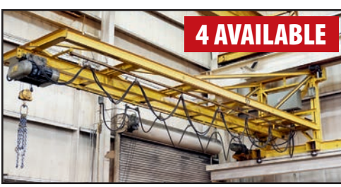
COLUMBUS MCKINNON 2-TON SEMI-GANTRY CRANES