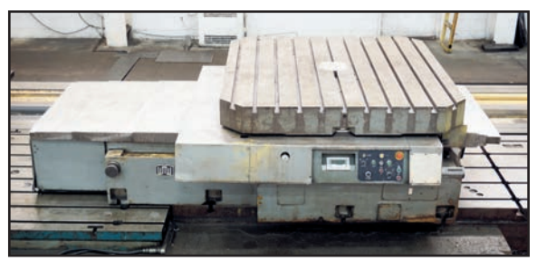
WMW UNION 79" X 71" CNC INFEED ROTARY TABLE

TOS ISO-16 86" X 86" INFEED ROTARY TABLE