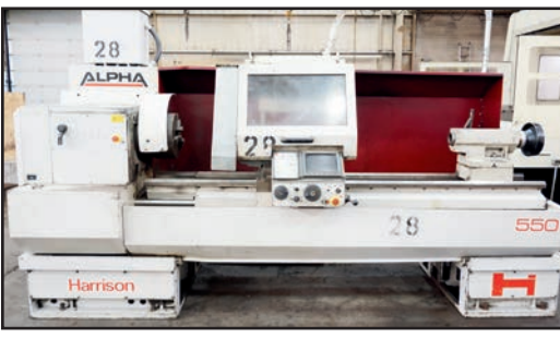
HARRISON ALPHA-500 CNC GAP BED LATHE

Inspection of assets in the sale is STRICTLY BY APPOINTMENT. We encourage inspections held via 1-on-1 video conferencing, however in person inspections can still be accommodated if required. Anyone showing up to the site without a scheduled appointment will be denied entry. Please call our office at +1-847-545-6374 as soon as possible to schedule your inspection.