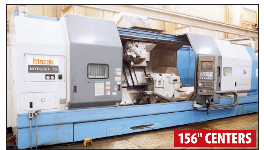
MAZAK INTEGREX 70-4000U CNC TURNING/MILLING CENTER