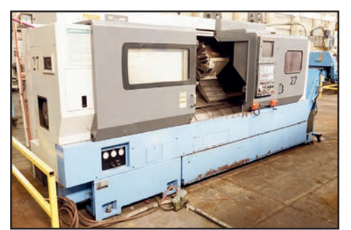
MAZAK SQT-30M CNC TURNING CENTER

Inspection of assets in the sale is STRICTLY BY APPOINTMENT. We encourage inspections held via 1-on-1 video conferencing, however in person inspections can still be accommodated if required. Anyone showing up to the site without a scheduled appointment will be denied entry. Please call our office at +1-847-545-6374 as soon as possible to schedule your inspection.