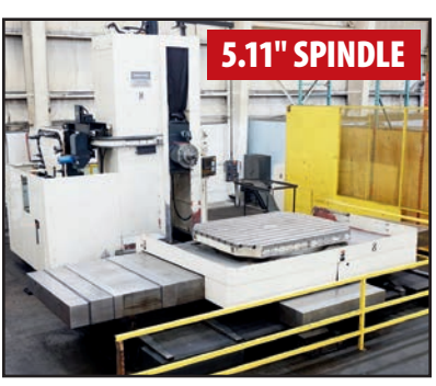
TOSHIBA BTD-13FR22 CNC TABLE TYPE HBM