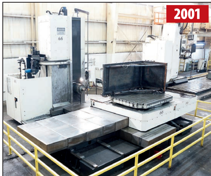
5.1" TOSHIBA BTD-13FR22 CNC TABLE TYPE HBM

View our current auction schedule at www.perfectionindustrial.com