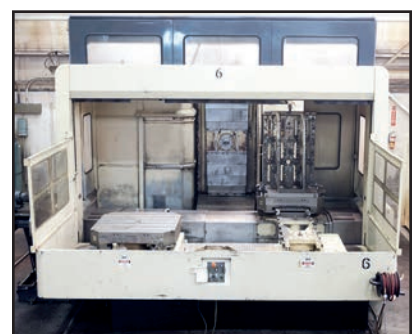
TOSHIBA BMC-100E CNC HMC