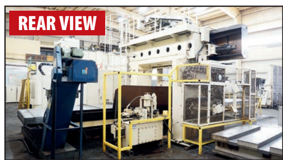
TOSHIBA SHIBAURA MPE-2140 CNC 5 FACE GANTRY MILL