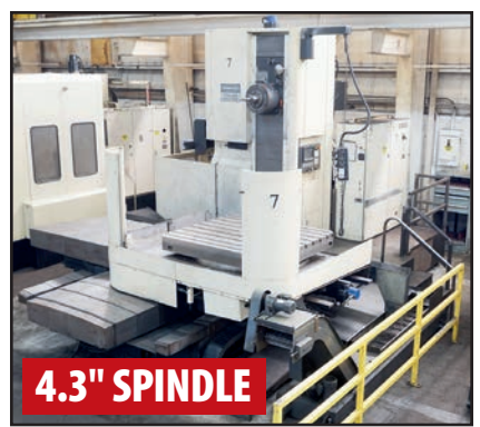
TOSHIBA BTD-110R16 CNC TABLE TYPE HBM