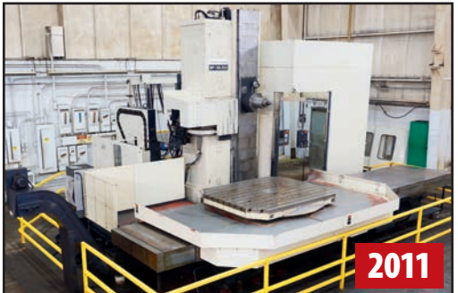
5.9" TOSHIBA BP-150R22 CNC TABLE TYPE HBM