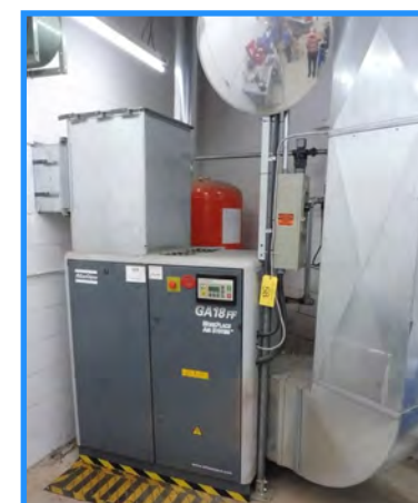
2002 ATLAS COPCO ROTARY SCREW AIR COMPRESSOR MODEL GA 18 FF, 25HP