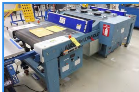
AMERICAN ULTRAVIOLET CO. CURING TUNNEL, 32" W, MODEL CV-30-2-T4