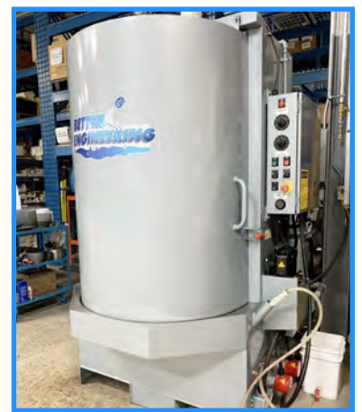
2017 BETTER ENGINEERING G-3000 PARTS WASHER