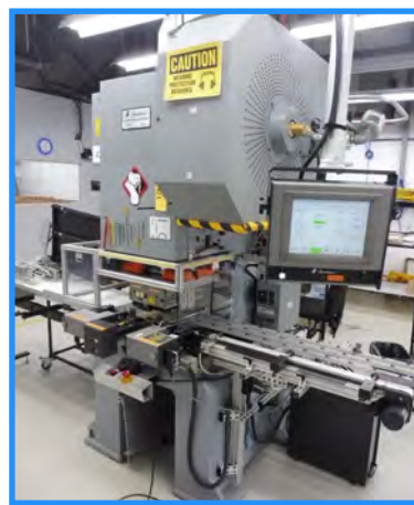
2013 SANGIACOMO DIE CUTTING PRESS, MODEL T50