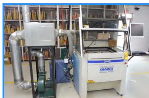
2017 SDI CO2 LASER CUTTER, MODEL EUREKA 606 CNC