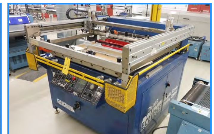
M&R SCREEN PRINTING PRESS, MODEL "ECLIPSE", 220 VOLT, SCREEN TABLE 46" X 40"