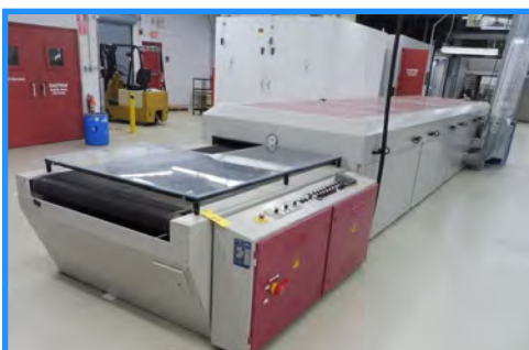
MULLER 3-SECTION CURING TUNNEL, ELECTRIC, MODEL 1300