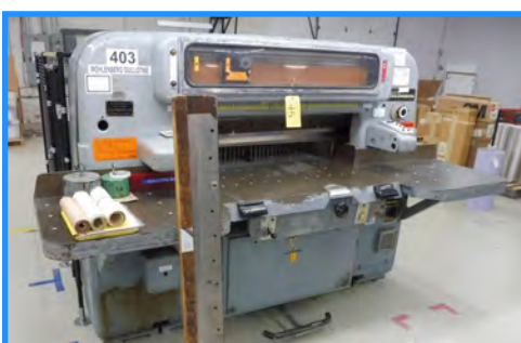
KRAUSE WOHLBERG 42" CAP. PAPER CUTTER, MODEL A-107-E