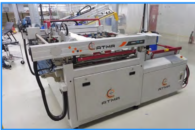
2017 ATMA HI-PRECISION SCREEN PRINTING PRESS, MODEL ATMAOE 710

WEDNESDAY, JUNE 16, 2021 BIDDING CLOSES STARTING AT 11:00 A.M. EST ONLINE BIDDING ONLY