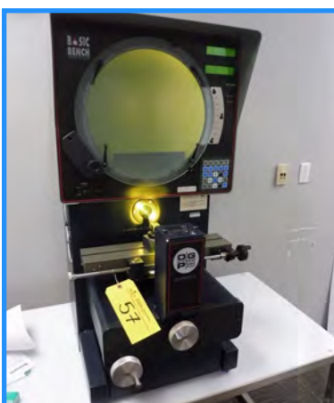
OPTICAL GAGING PRODUCTS OPTICAL COMPARATOR, 14" MODEL "BASIC BENCH"