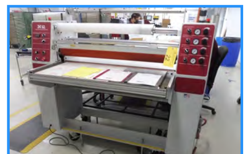
2015 AGL LAMINATOR, 42" CAPACITY, MODEL AGL4400T